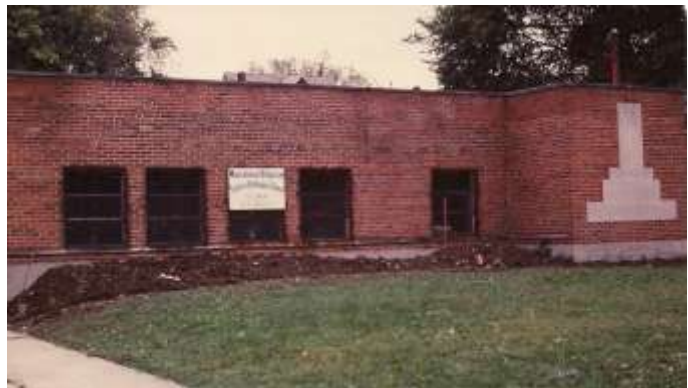
A dormant unfinished church Bulgarian Orthodox church building became the first home of the mission in Cincinnati.

But I believed at that point in my ministry that a problem that plagued Orthodoxy was her insular attitudes. Preservationism was something I also learned about there. People clinging so strongly to some ethnic beliefs and customs and it ultimately drives them away from Orthodox praxis. There were hundreds of Bulgarian/Macedonian families in the area, but precious few attended church services. I heard that their picnics were hugely successful, however. I came to see these ethnic churches as colonial outposts for mother churches far away. This complicates the ability of believers here to identify with the American needs and promise.