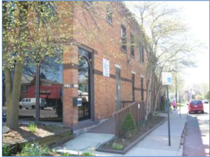
Present site of St Gregory of Nyssa Orthodox Church

The idea of the charity basket remains intact. Funds from this source are used for a variety of charitable needs within and without the parish. In addition, about 7% of our monthly income is used for contributions to worthy causes locally, nationally and internationally. We have helped Orthodox people in Russia during Communist years, the Indonesian Orthodox church, Project Mexico, children in Ethiopia, an orphanage in the Republic of Georgia, a Bishop in Lebanon, and many who needed money for rent, medications, eye glasses and other health needs.