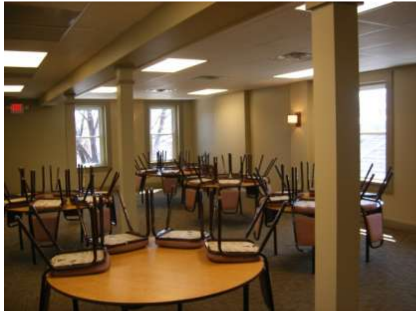
Parish's "Upper Room", above the church was completed with significant help from neighborhood persons. Parish ministries offer some job skill training for neighbors.

And how have we managed to overcome our fears? My wife was robbed at gunpoint on her way inside the building.