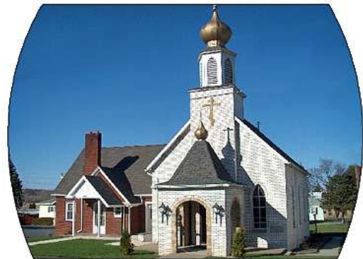
St John the Baptist Church; Phillipsburg PA

Not a platitude, for sure, not a platitude