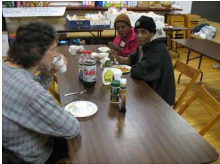
Neighbors relax after Saturday lunch.

People have shown up drunk. We've had to call the police. People have had to be removed from services. Some cannot help badgering individuals for money, even though it is well advertised that they should not do so. People have stolen from the Charities Basket... the list is a long one, but not long enough for us to hold back. There is a learning curve here. We've had to adjust, change, adapt.