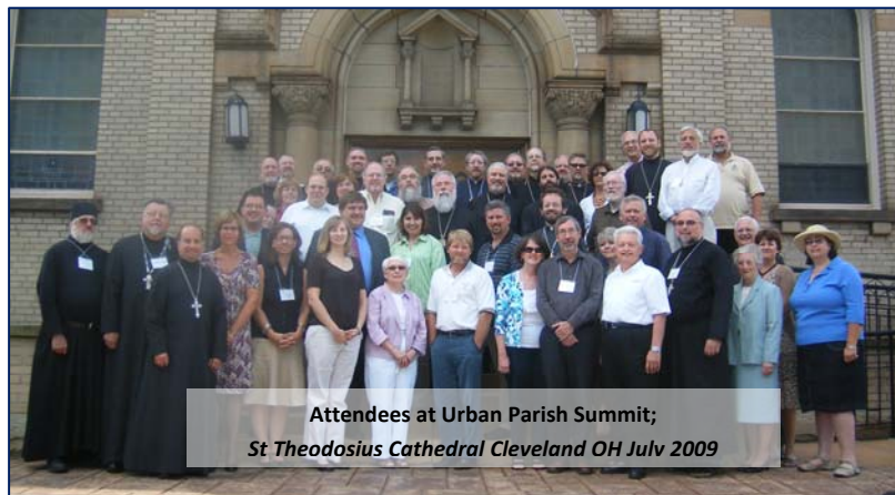
Attendees at Urban Parish Summit; St Theodosius Cathedral Cleveland OH July 2009