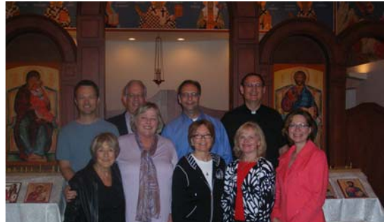
St. Mark's Grant Team takes pause after completing a successful six week parish training class